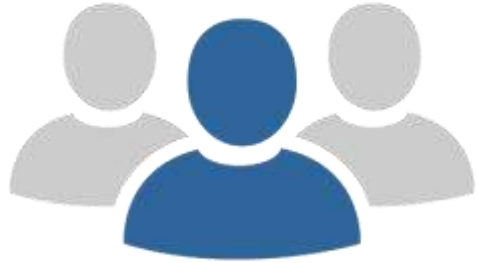
Community Cricket Staff