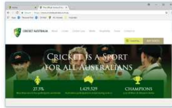
Cricket Australia Website